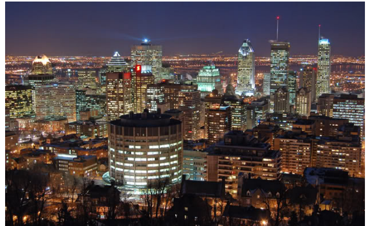
This year's meeting will be held in Montreal, Quebec, Canada