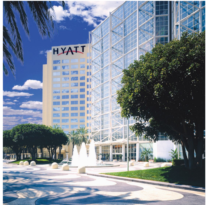
The 2011 meeting will be held in Orange County, California