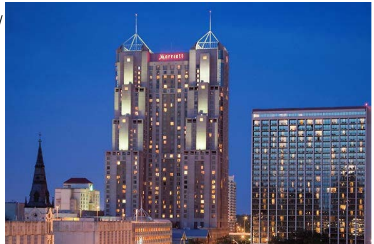
The meeting was held deep in the heart of Texas at the Marriott San Antonio Rivercenter Hotel.

The main Scientific Meeting expanded on the traditional SNO meeting format, which included plenary talks, top-scoring abstracts, minisymposia, "meet-the-experts" sunrise sessions, and events for young investigators, by incorporating a greater number of sunrise and lunchtime educational sessions and a SNO meeting highlights session organized by the Scientific Meeting Chairs. On